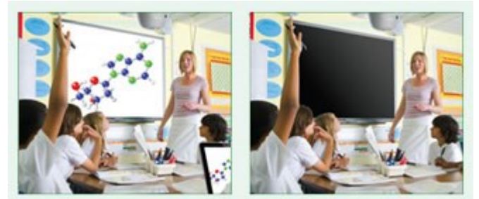
Eco AV mute off 100% power consumption

Stay in control of your presentation with Eco AV mute. Direct your audience's attention away from the screen by blanking the image when no longer needed. This also reduces the power consumption by up to 70%, further prolonging the life of your lamp.