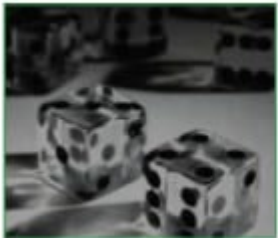
2000:1 Contrast Ratio

Add more depth to your image with a high contrast projector; with brighter whites and ultra-rich blacks, images come alive and text appears crisp and clear - ideal for business and education applications.