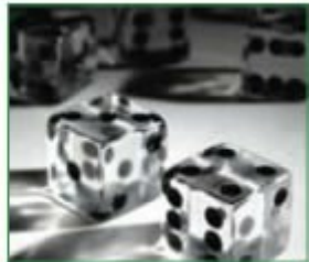
20,000:1 Contrast Ratio