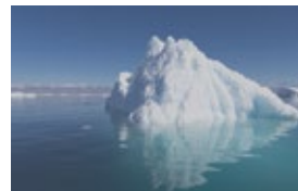
^ HDCR off