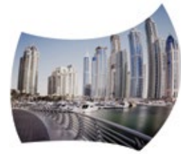
^ Curved screen - with blending