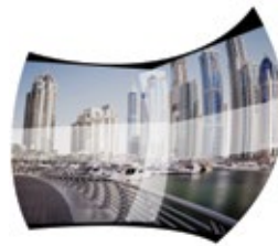
^ Image on curved screen - without blending

Unbeatable warranty - Five-year or 15,000-hour warranty (whichever occurs first)