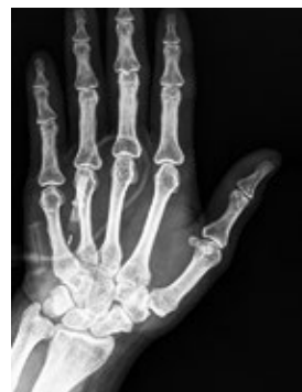
^ Standard mode