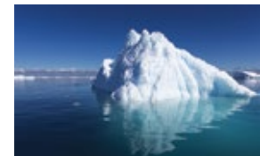
^ HDCR on