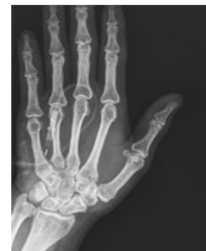
^ DICOM simulation mode