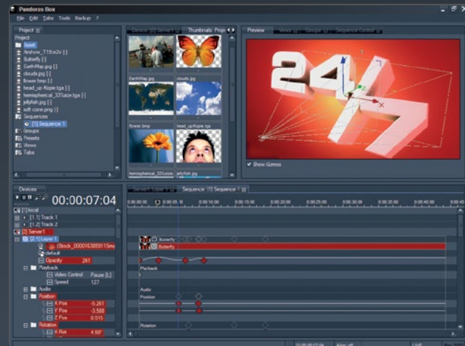
Screenshot User Interface

Arrange videos and images freely, change colour, form and position. Pandoras Box synchronizes all video & audio sources. On-site 3D rendering, composition and editing make Pandoras Box the perfect choice for any live event or multi-media show.