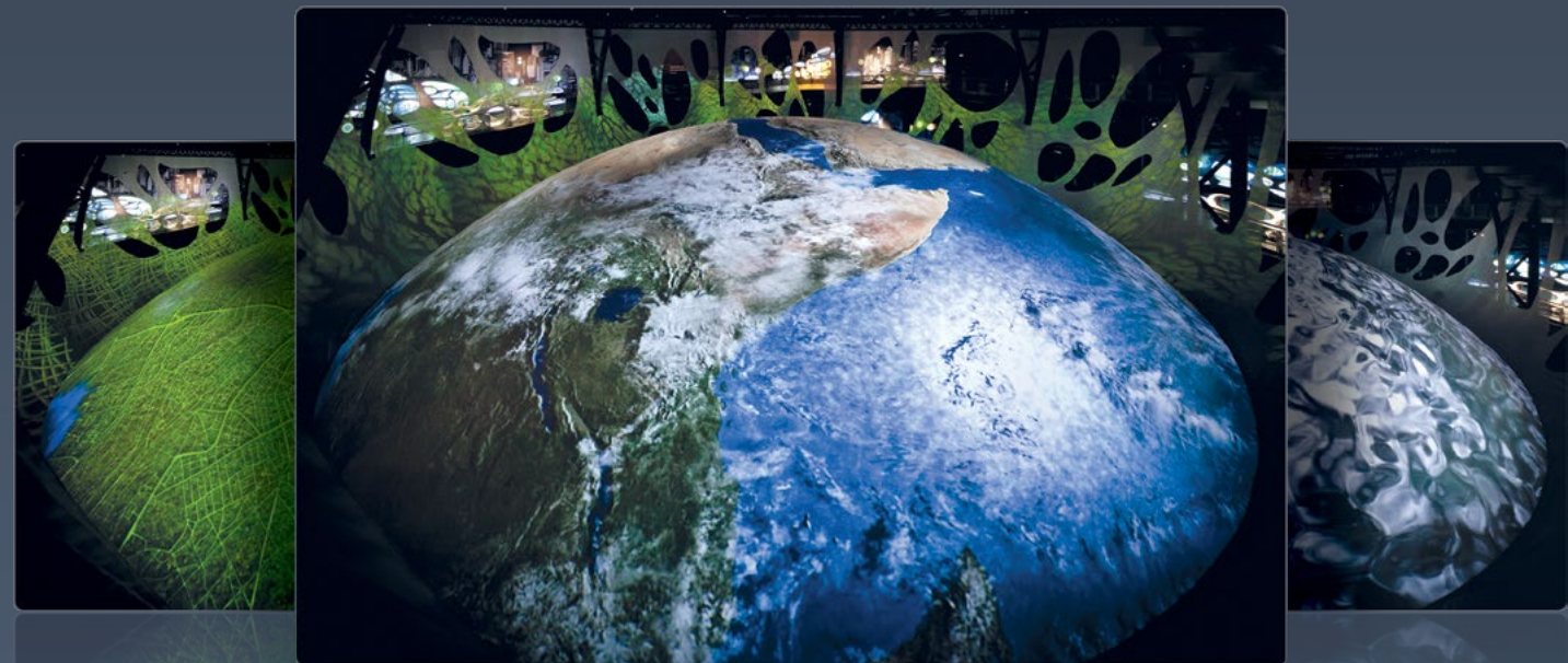
BLUE PLANET SHANGHAI EXPO - courtesy of TRIAD

The Softedge Blending feature works hand in hand with the built-in warping technology. This way either flat or shaped projections can be set up with multiple projectors. Each output can be offset independently and features individual control of the blend settings on each side of the output to allow both horizontal and vertical blend setups.