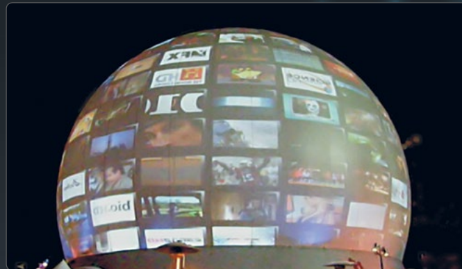
Direct TV - FireFly LA

One of the key features of Pandoras Box Server Systems is the broadcast quality of the low-latency video and PC input options. Featuring both SD and HD-SDI inputs with as low as 2 frames of processing time, Pandoras Box Server Systems come with a set of real-time de-interlacers to process interlaced camera feeds at full framerate.