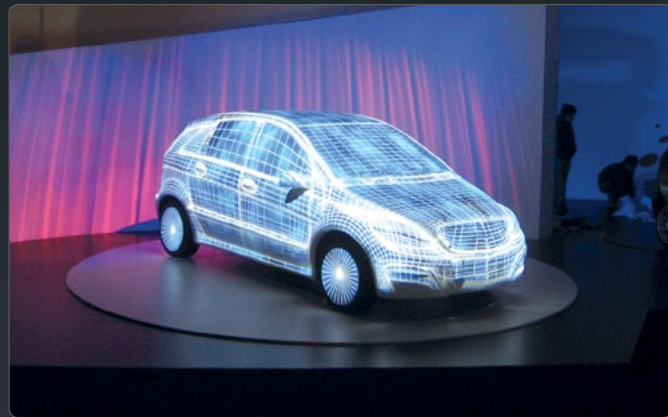
Mercedes B-Class Launch - China